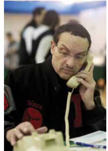
ABOVE: Washington D.C. Mayor Vincent Gray at Super Sunday