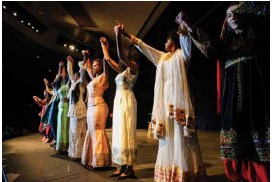
ABOVE: Hayfield Secondary School students performing at their first International Night

In the coming months, these leaders will design and implement synagogue programming. The programs will be dedicated to reducing hunger in our region; enabling access to healthy and affordable food; encouraging environmentally sustainable farming; and promoting safe workplaces and fair wages for all food production workers, from farmers to restaurant workers. They will spend the year working with their synagogue communities to address the causes of food injustice.