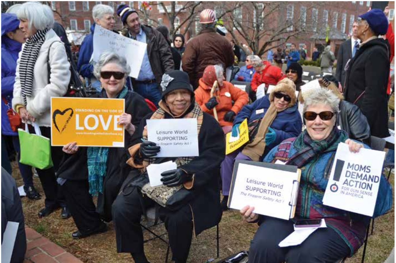
ABOVE: Leisure World residents at the Rally to End Gun Violence in Annapolis.