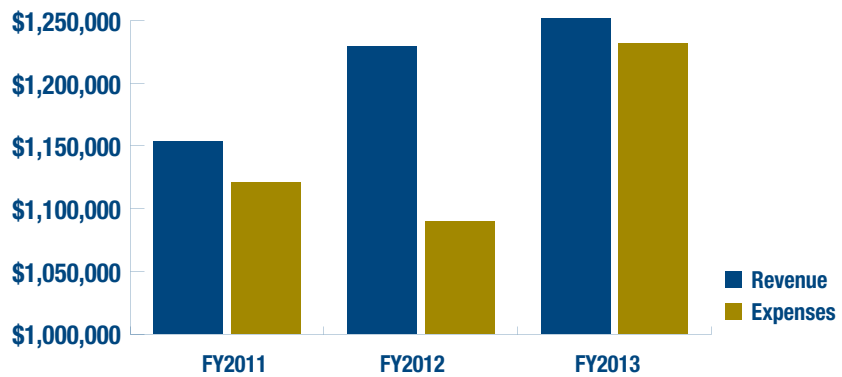
Revenue and Expenses

Over the last three years, the JCRC has steadily grown with revenues exceeding expenses, allowing the JCRC to continue to fund the programs much needed by the community.