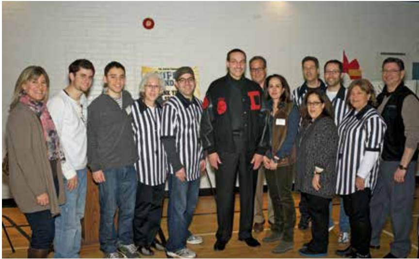
ABOVE: Super Sunday participants with Washington D.C. Mayor Vincent Gray.